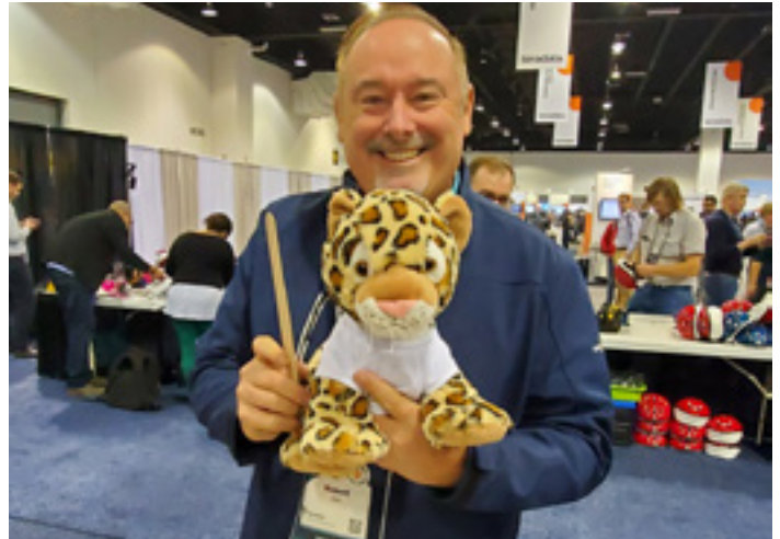
Teradata Universe Conference, Teradata Cares Activity.

variety of activities to give back to children and support animal welfare. They built bikes and assembled STEM planters for classrooms. They built dog houses, put together animal care kits and created dog blankets and toys. Our customers tell us year after year that it's a pleasure to take some time and give back while attending the conference.