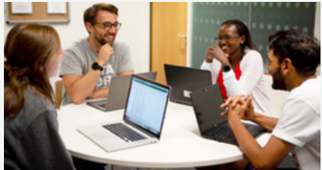
Elsevier Foundation and Teradata, DataKind DataDive, London, July 2019.

In July, we co-sponsored a DataDive in London with Elsevier Foundation. Read all about the important data projects here.