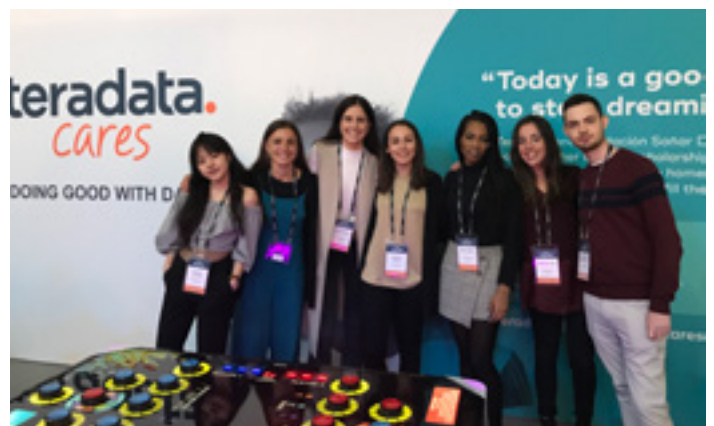
Teradata Universe, Fundación Soñar Despierto.

During our European customer conference, Teradata Cares supported Fundación Soñar Despierto, whose mission is to support kids living in foster care institutions in Spain from childhood to independence. Through combined Teradata and customer donations, the organization received more than $10,000 to support their inspiring mission.