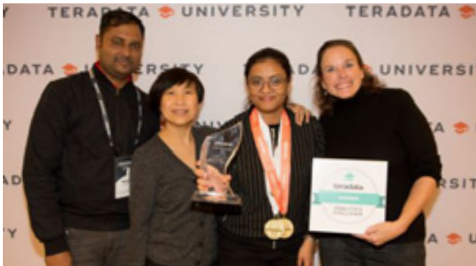
People's Choice Winner – Asia Pacific University, Malaysia.