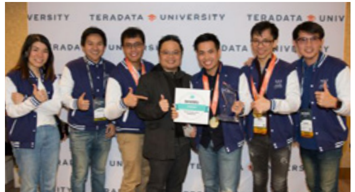
Teradata Technology Award Winner – NIDA Business School, Thailand.