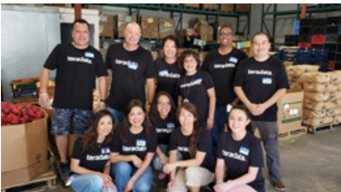
San Diego gives back at the North County Food Bank.