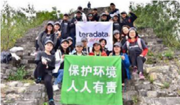
Beijing employees picking up discarded rubbish at the Great Wall.