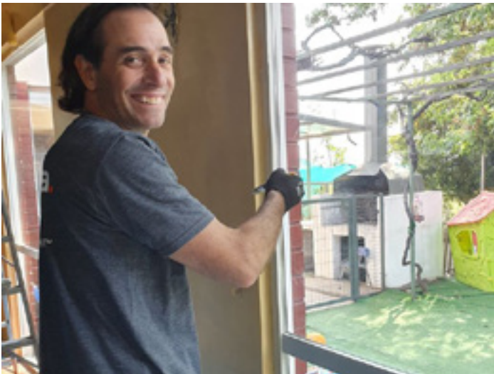
Chile team volunteering with Hogar Esperanza Foundation.