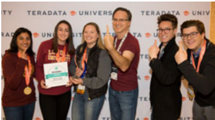
Best Visualization Winner – Loyola University Chicago, USA.