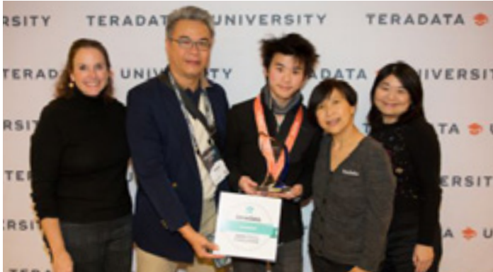
Overall Winner – Lawrenceville School (high school), USA.