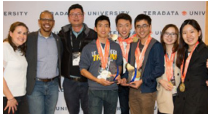
People's Choice Winner & Most Value to Hire Heroes USA – University of California San Diego, USA.