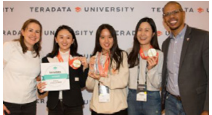
Overall Winner – Washington University St. Louis, USA.