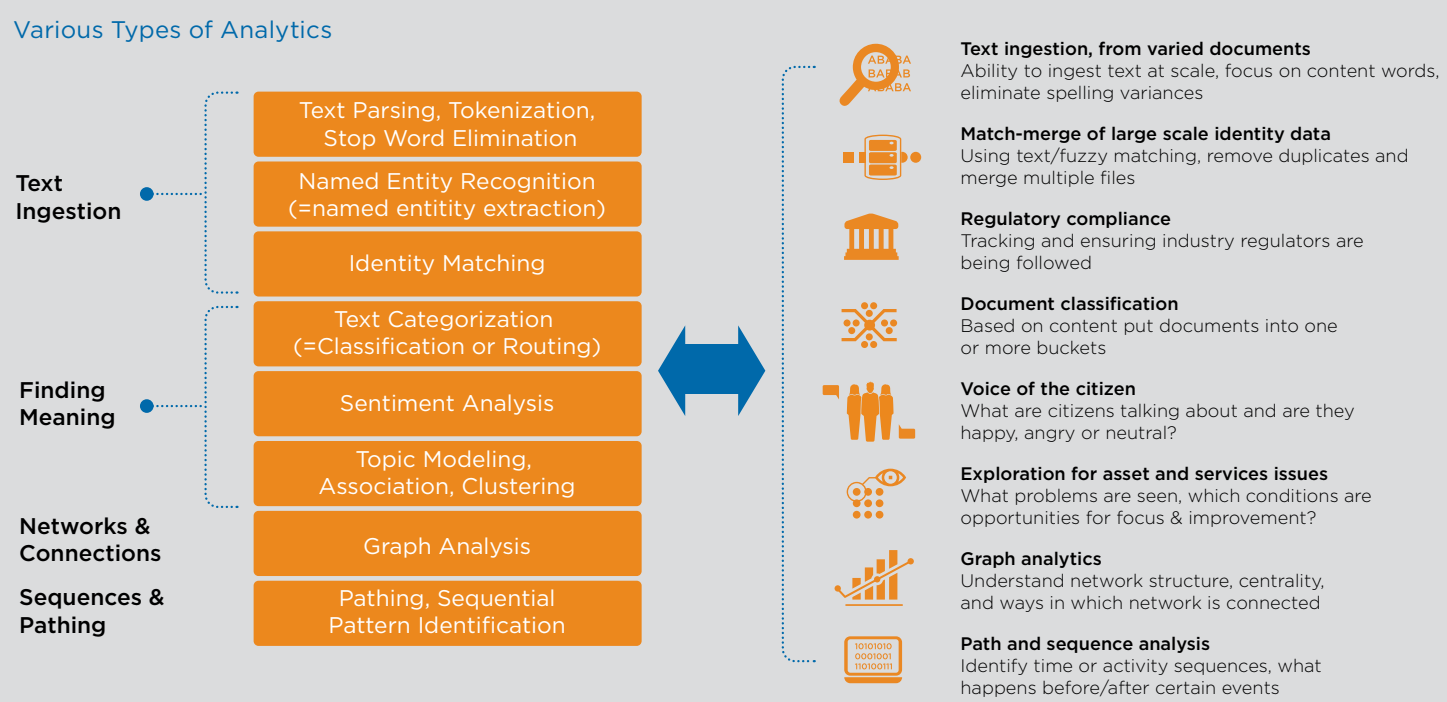
Figure 2: Different kinds of analytics apply in cases of big data that involve text

Text data first needs to be transformed to reduce the variability of written and verbal speech (e.g., different spellings, errors, and abbreviations). "Stemming" reduces variations of the same word, and "stop word elimination" drops words that convey little meaning. More complex transformations extract named entities (individuals or accounts) or facilitate identity matching where names are used differently in different source systems. This needs to be done at scale, and be adaptable to different formats of documents.