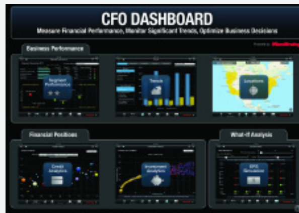
Figure 1. A View of the CFO Dashboard on iPad.